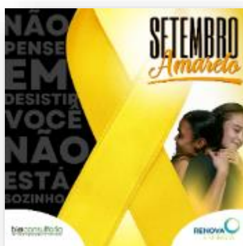
Figure2 - Piece of the Campaign lecture

Thus, Renova Energia consolidates the channel for dialogue between the industries involved and affected, directly or indirectly, by the aforementioned project, celebrating the strengthening of the relationship with stakeholders.