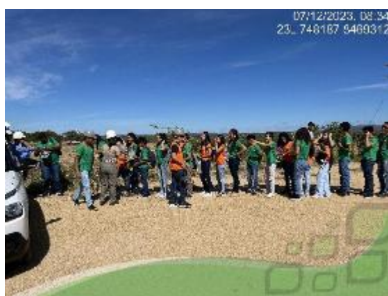
Image 1 - Technical visit by students to the Alto Sertão III Complex wind farms.

Renova Energia participated in the 2 nd Business Fair in the municipality of Pindaí/BA with an exhibition of handicrafts and family farming products. During the event, the Company's social team carried out an action aimed at environmental education with debates on the environment, educational and informative lectures focused on family farming and entrepreneurship, as well as planting seeds.