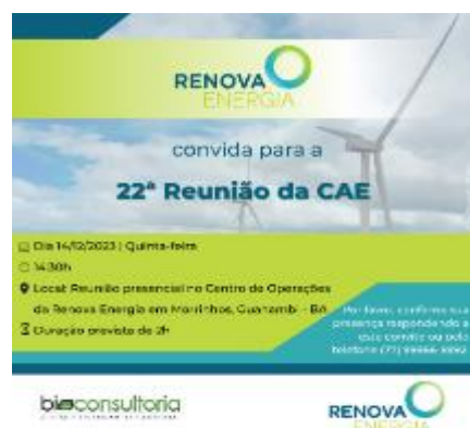
Figure 1 - Invitation to the 22 nd CAE Meeting

In the Alto Sertão III project, operating in the state of Bahia, the 22 nd Ordinary Meeting of the Project Monitoring Committee – CAE was held on December 14, 2023. The members of the Commission (Governmental & Non-Governmental representatives and community leaders) had the opportunity to exchange information about the operational phase of this project, covering the aspects of meeting the conditions, with updates on the execution of basic environmental programs.